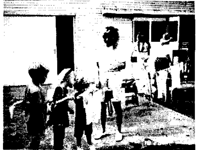
Children from the Neighborhood Christian School in Whittier learn what it was like to wash and dry clothes the old-fashioned way.