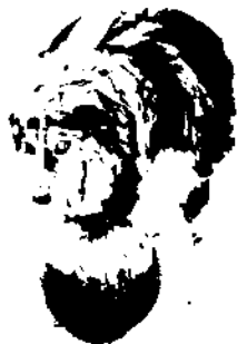
At left is Minnie-top notch Soccer dog! She'll be 12 years this September.